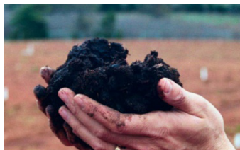
High quality compost is decomposed before it is added to the soil.

Animal manures are commonly used as a garden soil amendment. The nutrient content of manure varies. Fresh horse, sheep, rabbit, and poultry manures are quite high in nitrogen and may even burn plants if