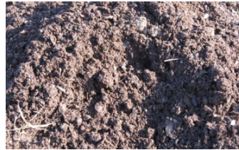
Composted manure can be purchased in bulk by a community garden or a group of gardeners.

Another source of inexpensive soil builder is the cover crop. Green manures, or cover crops, such as annual rye, ryegrass, buckwheat, and oats, are planted in the