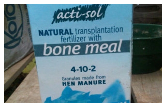
Bone meal is an example of a natural source fertilizer.

Most natural source fertilizers take some time to break down in the soil so the timing of application is important. Organic materials such as raw or partially decomposed manure, leaves, grass clippings, and seaweed should be applied the previous fall and incorporated into the soil or composted and applied in the spring before planting. Liquid teas made from compost or manure can be applied throughout the growing season.